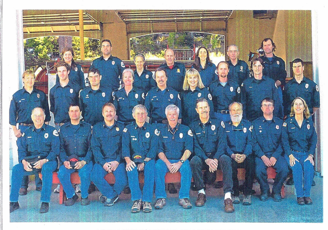
MENDOCINO VOLUNTEER FIRE DEPARTMENT October 9, 2010